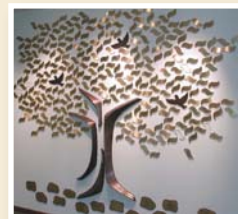
The Founder's Tree

Thanks to a unique partnership between the Grange Insurance Audubon Center and Columbus Audubon (the local chapter of the National Audubon Society), a special Founding Membership is now being offered that entitles you to all of the benefits of both organizations through one all-inclusive membership.